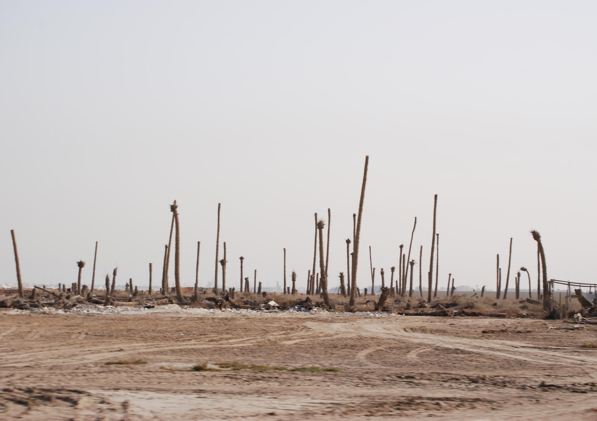
Preparation of land for new development, Nabeh Saleh, Bahrain.