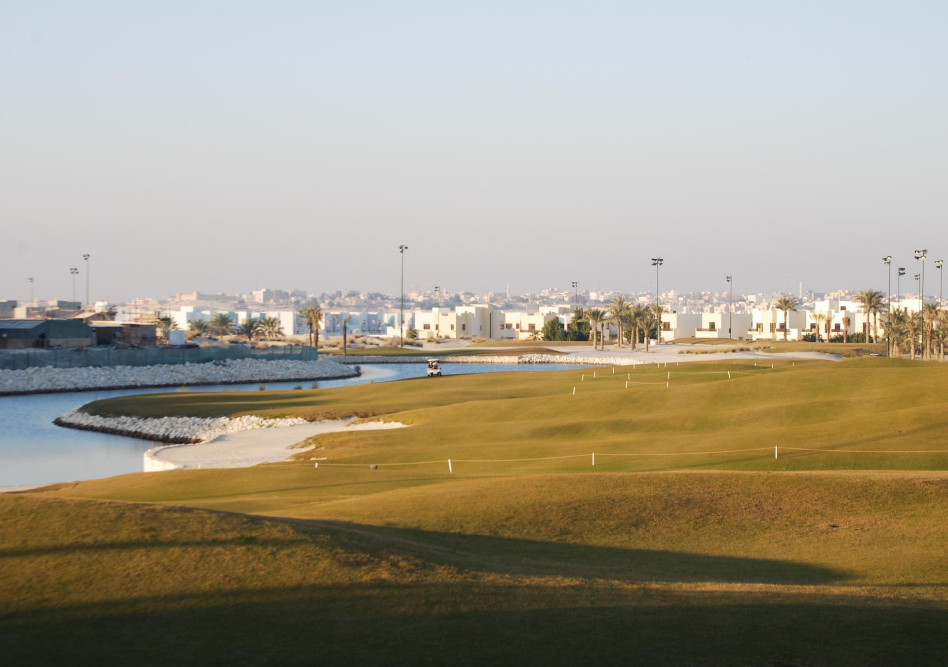
The Royal Golf Club at Riffa Views, Bahrain. Photograph by the author, 2010.