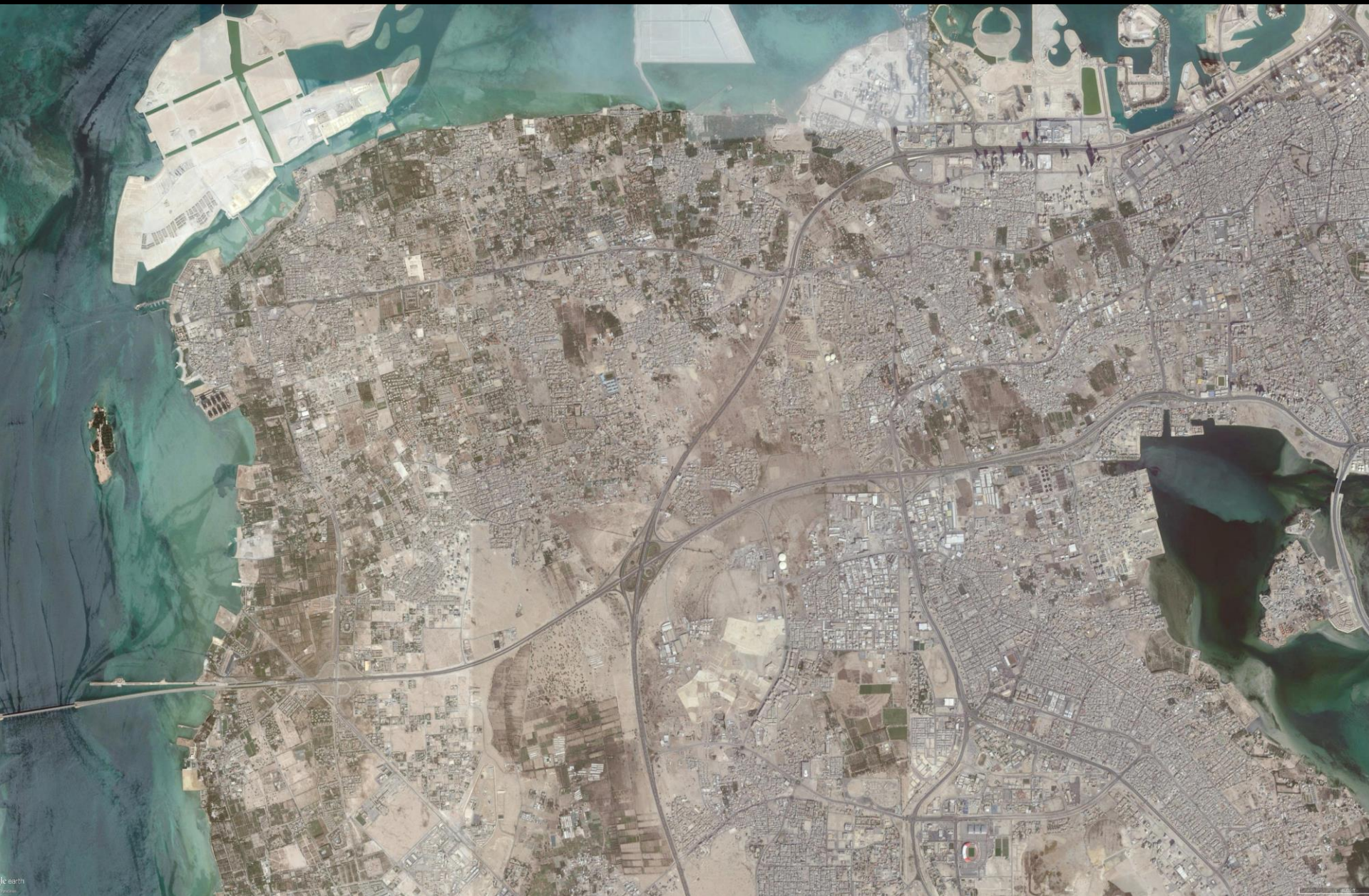
Satellite image of the north of Bahrain, 2016, showing Manama on the top right and Budaiya on the top left. Pockets of greenbelt can be seen on the middle right. New reclamation projects line the north coast.