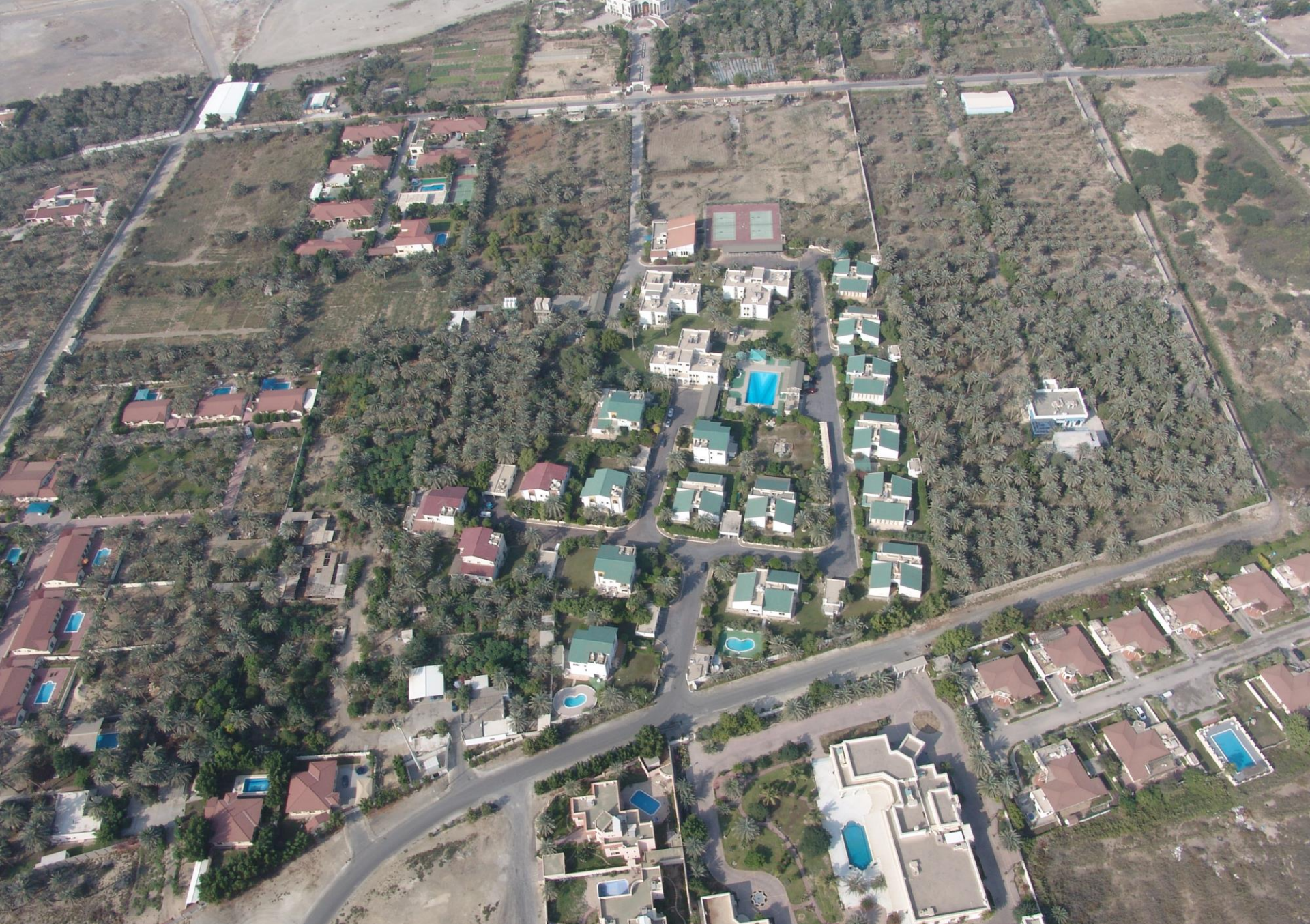
Date palm groves being replaced with villas with green painted roofs, 2006.